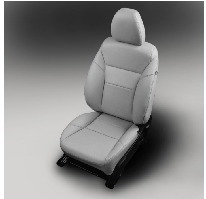
F2 ASH FI68-102