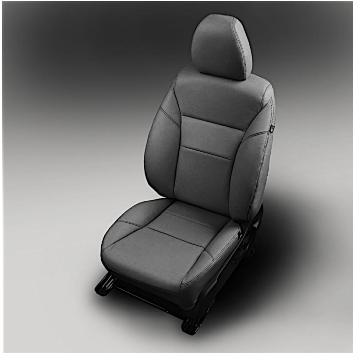
F1 BLACK FI68-100